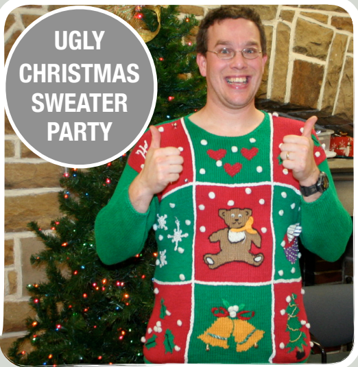
UGLY CHRISTMAS SWEATER PARTY

Event Sign Up Deadline is ONE week prior to Event!